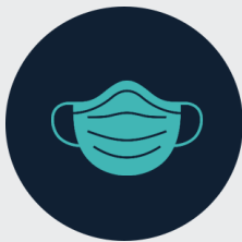
Masks Required In All Communal Areas