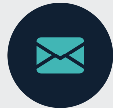
Sanitized Mail & Deliveries Protocols