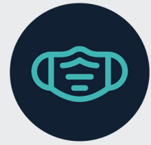
Dedicated Emergency Quarantine Room