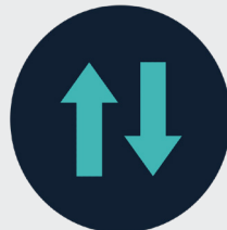
Health, Hygiene & Cleanliness Signage Throughout The Building